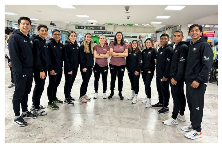
begun their competitive tour of Europe and Oceania.